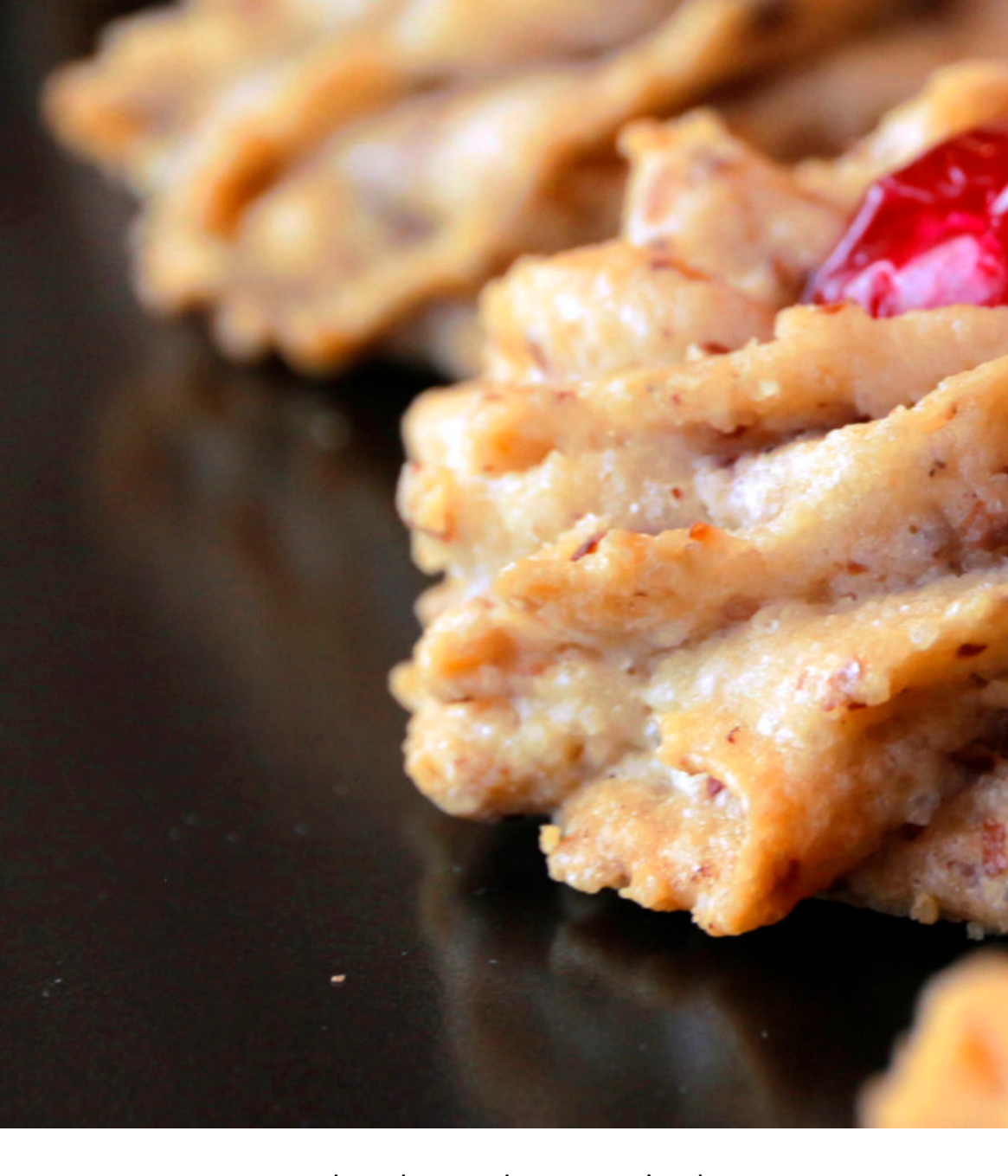
We select the very best Organic wheats. We grind excellent Organic Flours. We produce organic and Gluten-Free Flours from cereals. We produce fine pastries.